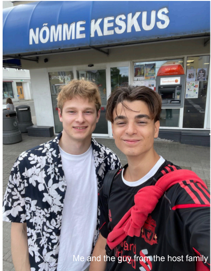
Me and the guy from the host family

From June 30th to July 19th I had the opportunity to take this trip to Estonia, it was a beautiful experience and one that I will always carry with me. It gave me the opportunity to see the world outside of my country, get to know different cultures and improve my English. The first 10 days I was in Tallinn with my host family who didn't let me miss anything, treated me like a son and showed me a lot of things about Estonia, the family was made up of two parents and 3 children , two males and the female who however lived alone in another part of the city. After these 10 days I went to the campus where I stayed for another 10 days