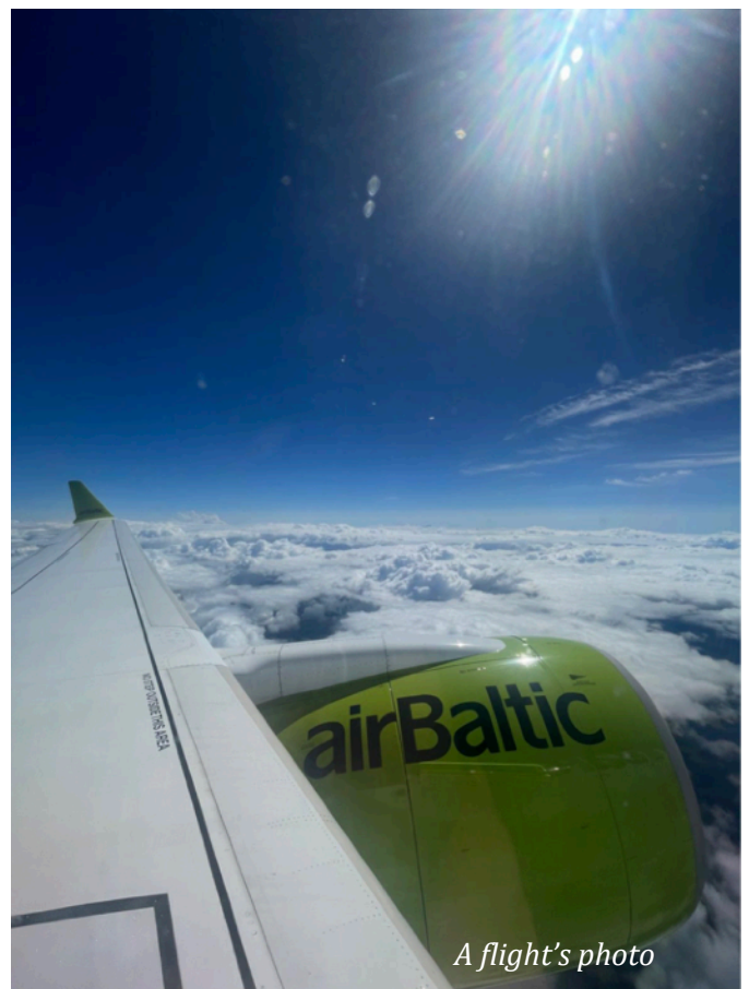
A flight's photo