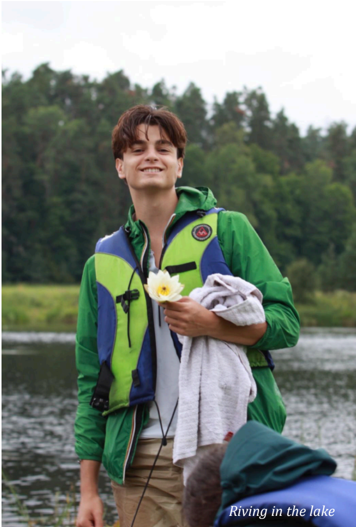
Riving in the lake