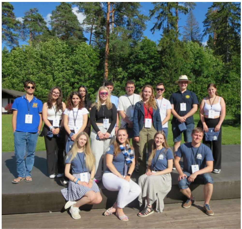
Me and the members of the camp