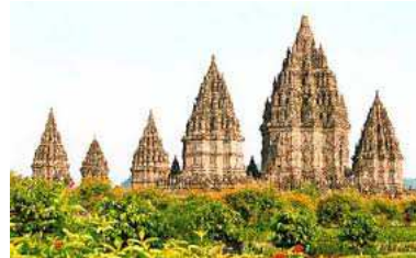
Borobudur Temple Prambanan Temple near SOLO