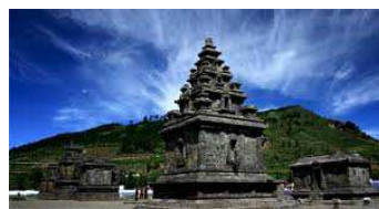
Wonosobo, Central Java